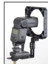
Pocket Wizard Flex TT5